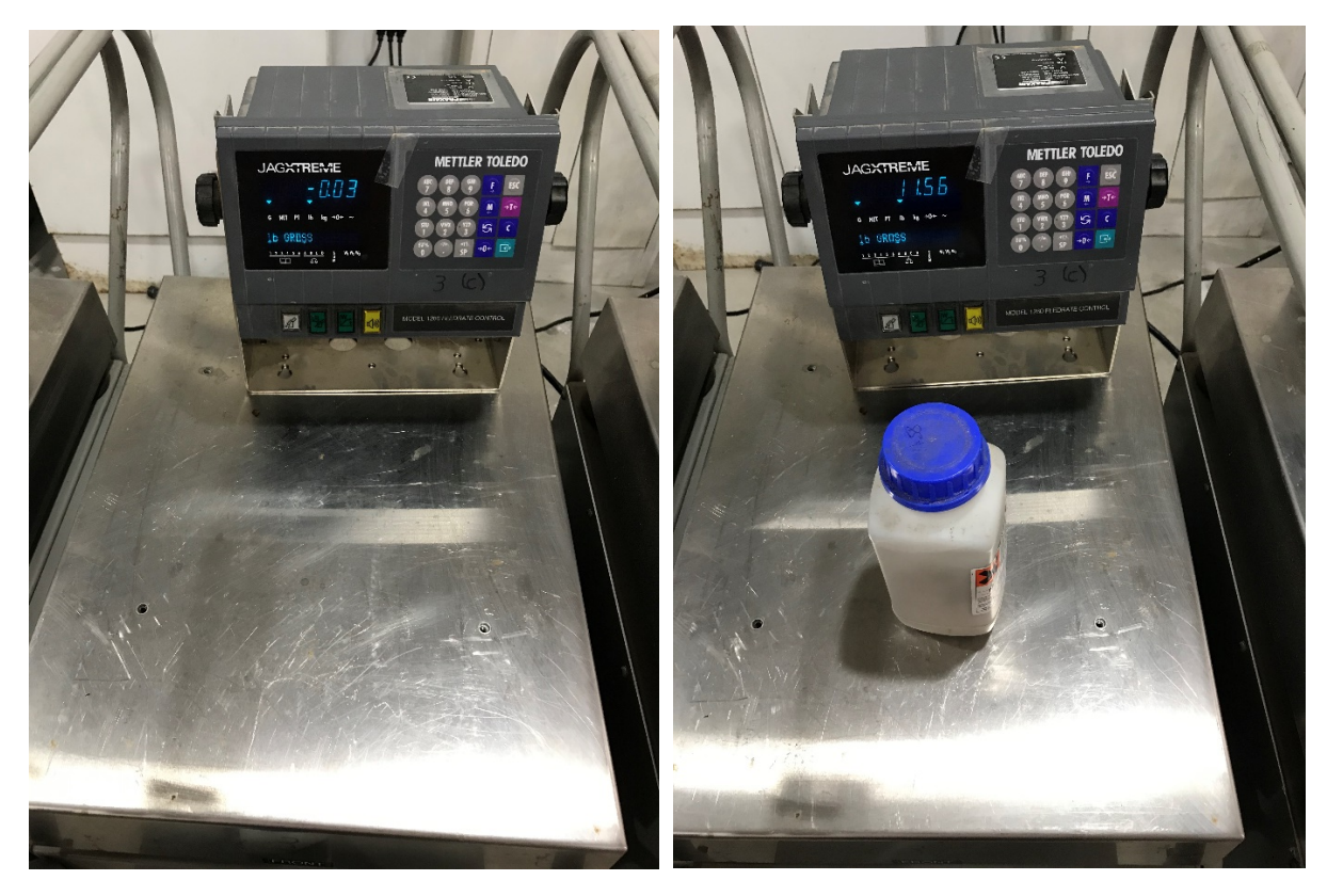
Scale #1 before and after 11kg (11 pounds of powder plus weight of bottle)