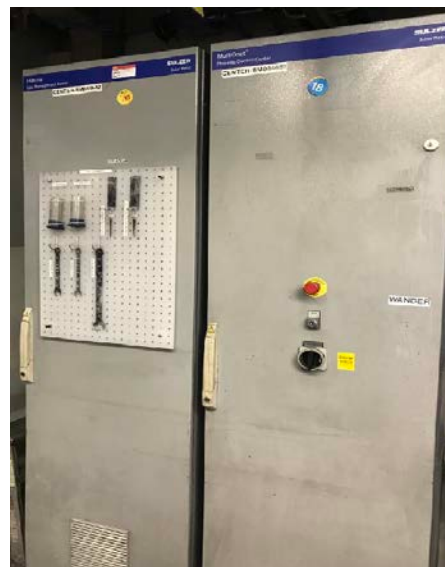
Gas and Electrical control cabinets