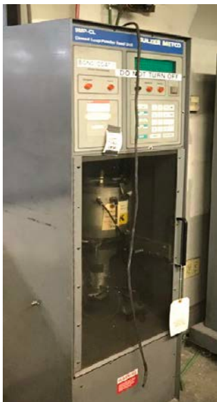
9MP Powder Feeder